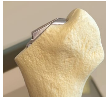
Figure 3 This photo shows a broach properly seated in the bone.