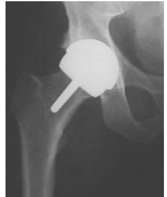
1 st U.S. BHR ◇ system Patient