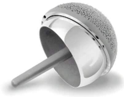
BIRMINGHAM HIP ® Resurfacing

Hip resurfacing expanding “younger” market