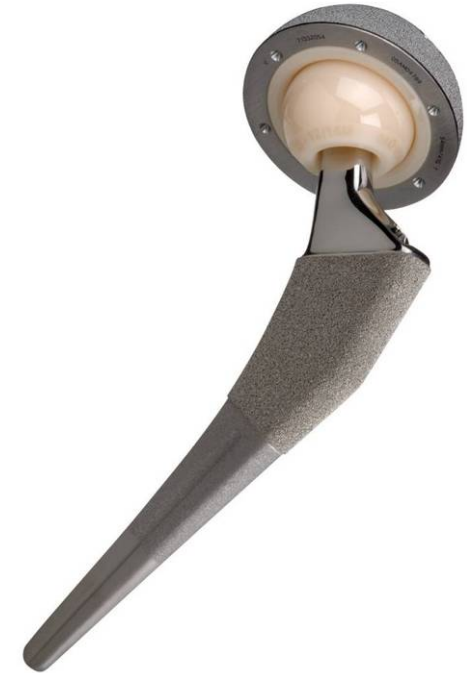
ANTHOLOGY ® Flat Hip System