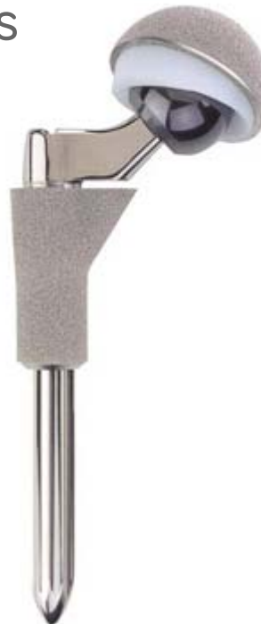
EMPERION ® Modular Hip