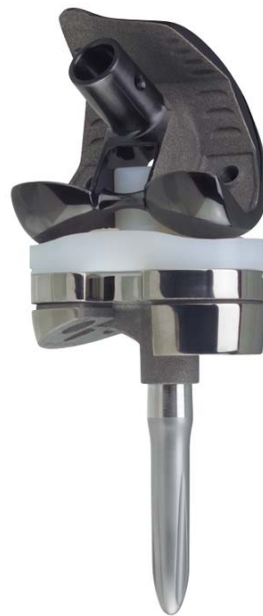
LEGION® Revision System