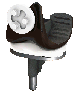
JOURNEY ® Bi-Cruciate Stabilized Knee