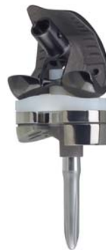
LEGION ® Revision Knee