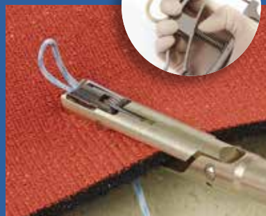
3. Depress forward button to disengage jaw (suture is retained by self-capture door) and remove device from joint space.