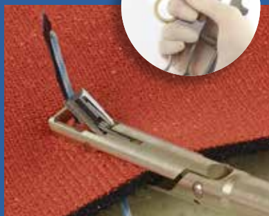
2. Squeeze rear handle to deploy needle and pass suture. Release rear handle to retract needle, leaving suture loop passed through tendon.