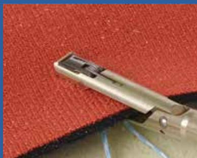
1. Position on rotator cuff tendon at desired site and close jaws.