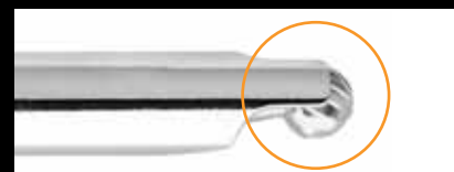
DYONICS High Visibility Sheath Abrader Burr